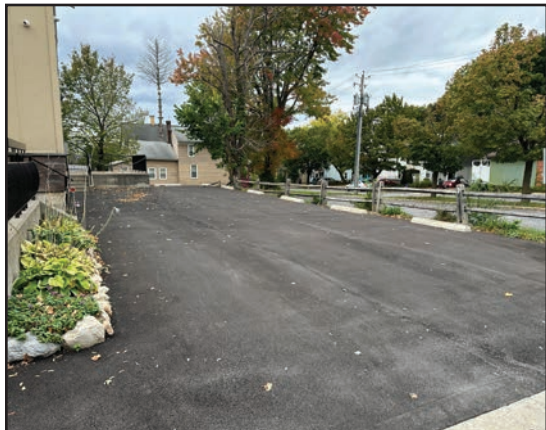
The driveway next to the theatre has been paved.

Here's how your patronage and donations are helping us improve and maintain your community theatre