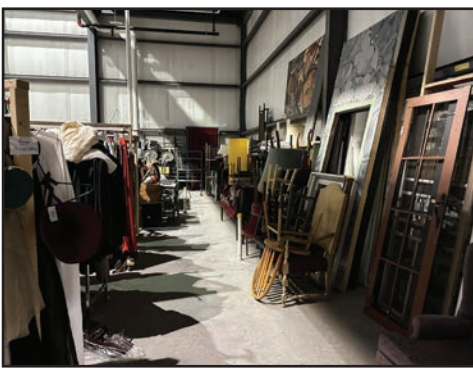
The backstage storage area has been neatly organized.

Numerous leaks in the lobby ceiling have been plugged.