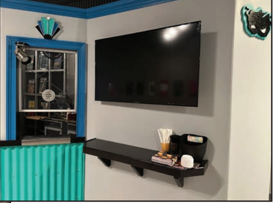
A donated TV has been mounted to the concession wall for show promotions, and a shelf has been added for coffee self-service.