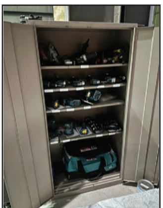
An array of much-needed tools was purchased for mainentance and the construction of show sets.

Many thanks to Rick Stoodley and the Building and Grounds Committee for spearheading all of these great improvements.