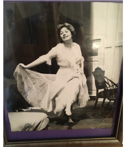
In Walt of the Toreadors , 1960.