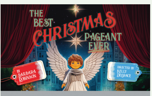
DEC. 6-8, 13-16, 2024