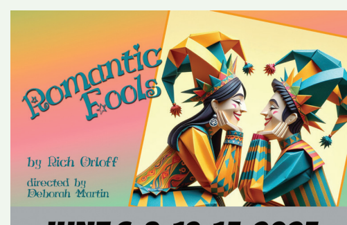
JUNE 6-8, 13-15, 2025