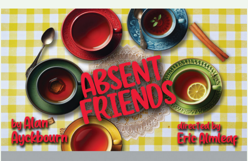
APRIL 4-6, 11-13, 2025